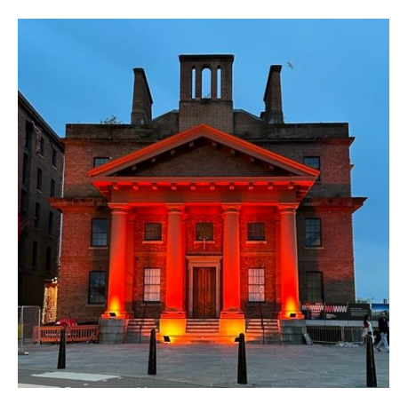
The Dock Traffic Office, Salthouse Quay, Liverpool