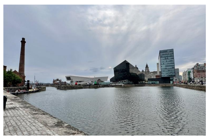
Royal Albert Dock, Liverpool