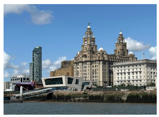
Royal Liver Building, Liverpool