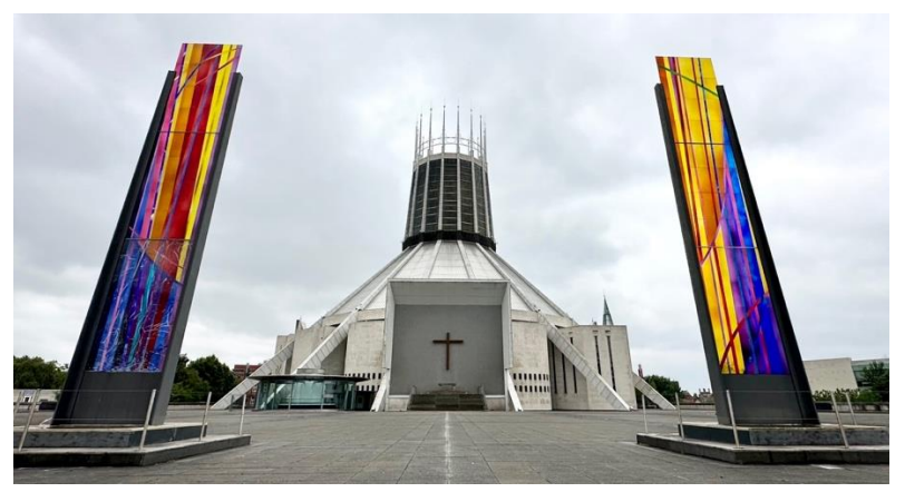
The Liverpool Metropolitan Cathedral